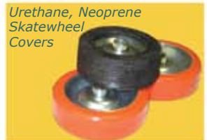
Urethane, Neoprene Skatewheel Covers