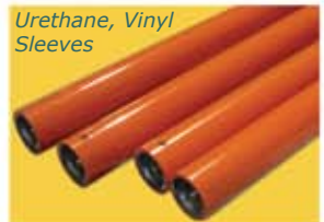
Urethane, Vinyl Sleeves

Food Grade and High-Temp sleeves are available.